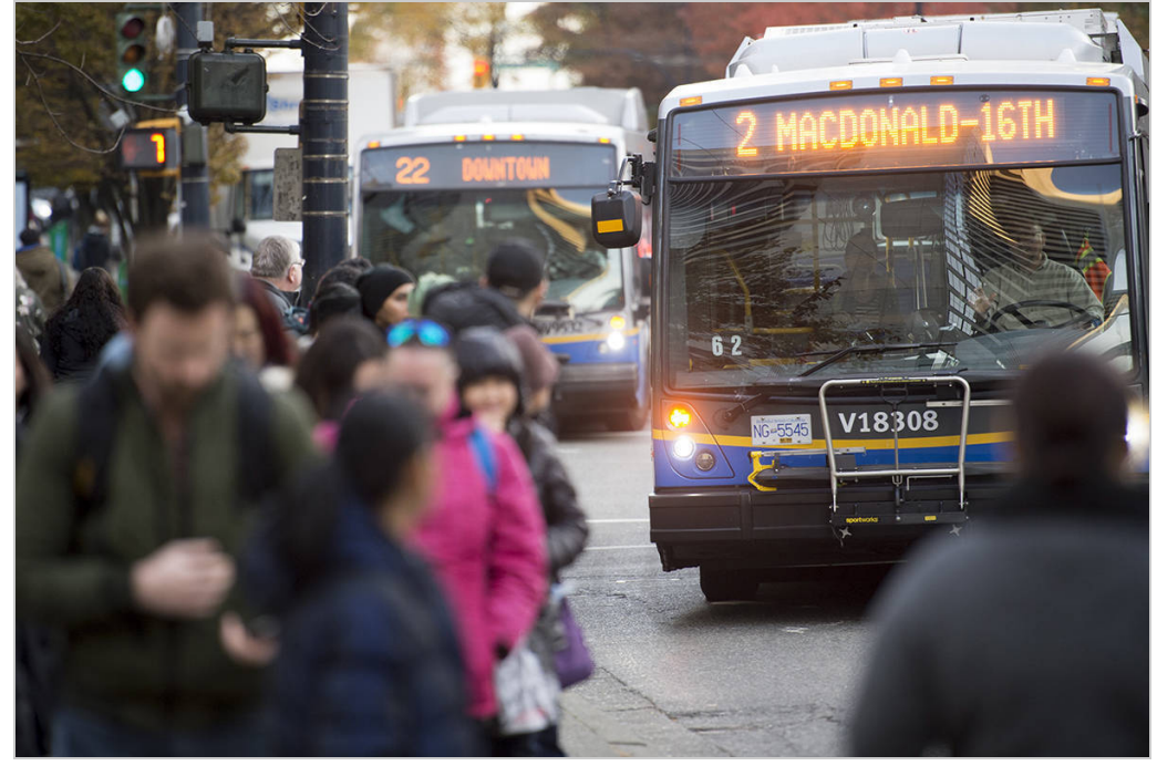
FILE – A bus is pictured in downtown Vancouver, Friday, November, 1, 2019.