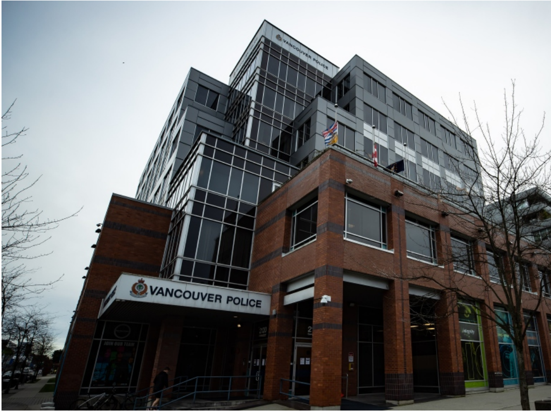
Vancouver Police Department headquarters is seen in Vancouver, on Saturday, January 9, 2015.